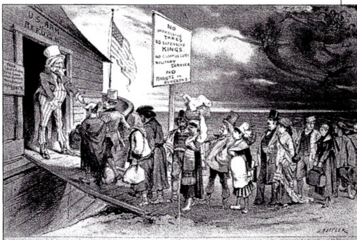
An 1880 cartoon showing Uncle Sam welcoming immigrants.

It is true that small groups of anarchists, socialists, and other radicals did advocate violent revolution. The anarchists accused of the bombing in Haymarket Square in Chicago in 1886 were probably all innocent. Yet they did glorify violence, and in doing so they angered not only wealthy business owners, but most workers as well. Even in a severe depression in 1896, millions of industrial workers backed William McKinley over reformer William Jennings Bryan.